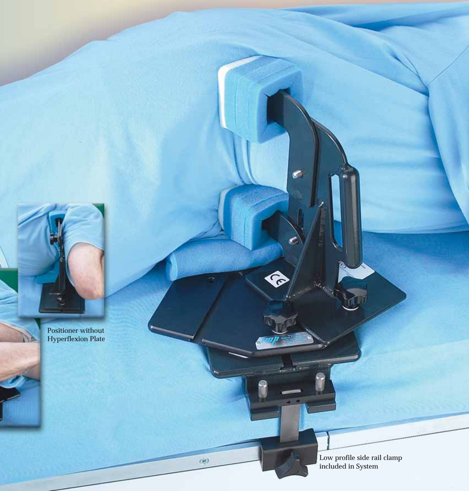
Positioner without Hyperflexion Plate