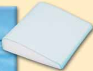
Latex Free Foam Pad Set

Contour Lumbar Pad, Cat. #1002-P, conforms to patient anatomy improving alignment and pressure distribution.